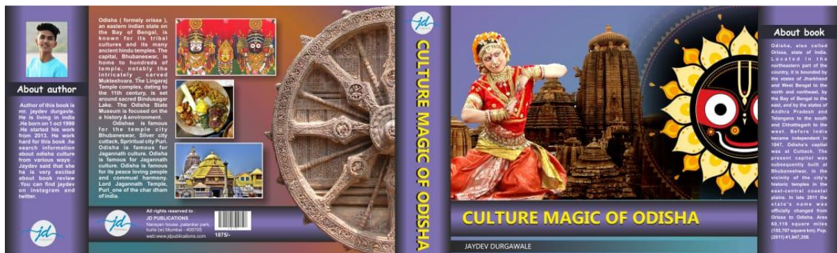
Book Jacket on Odisha